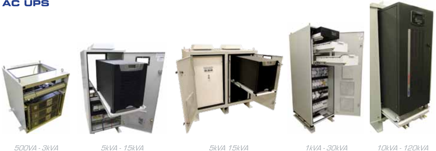
500VA - 3kVA