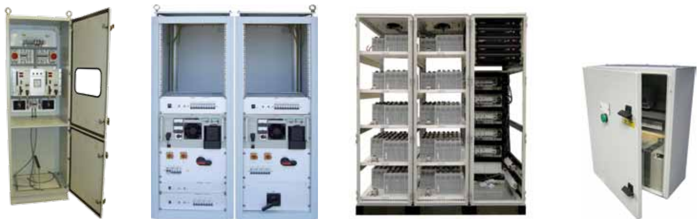
Dual Redundant DC Chargers